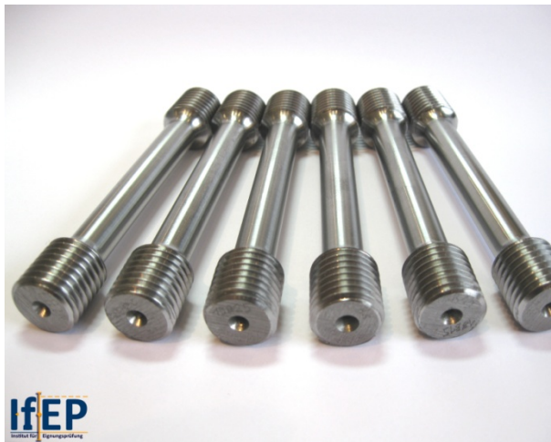
Round bar test specimens